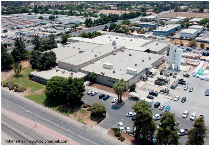
PolymerPak - www.polymerpak.com